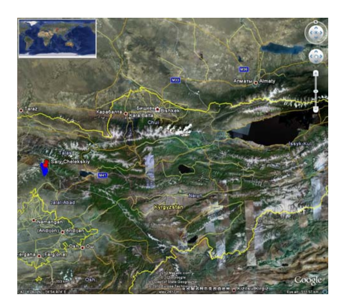
Figure 1. Google Earth image with study area marked in blue (red pin).

The project study area is in the west of Kyrgyzstan close to the Ferghana valley and encompassing the lower slopes of the Tien Shan mountain range (Figure 1). The project will particularly focus on Sary Chelek Biosphere Reserve, established in 1978 and covering an area of 23,868 ha. This reserve contains distinct tree species assemblages dominated by walnut ( Juglans regia ) and containing many other fruit- and nut-bearing trees, including a high diversity of apple ( Malus ), pear ( Pyrus ), cherry and plum ( Prunus ) species (Figure 2). Socio-economic research activities will take place in the villages and forest units in and around the Biosphere Reserve, and the additional areas of Kara Alma and Kyzyl Unkor.